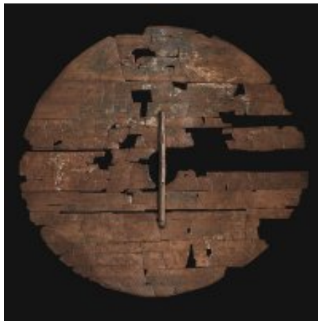
The same shield after it had been cleaned