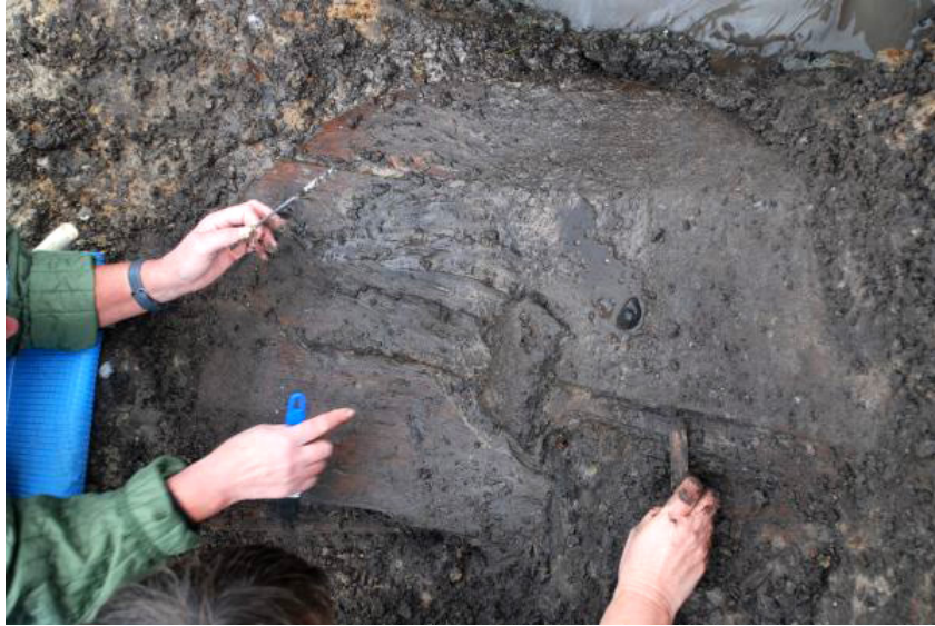
Found in Trelleborg in Denmark